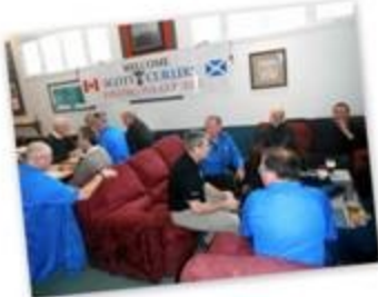
Legion Teams won both games!