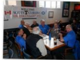
New friends and good cheers after the games

Congratulations to the two Legion teams that hosted the SCOT'S for some great curling, competing for the Strathcona Cup. The Strathcona Cup is a hotly contested bonspiel that is played by Scottish and Canadian curlers who have alternated visits to each others country every five years since 1902. Two other visiting were playing simultaneous at Whitlock. Unfortunately the two Whitlock teams did not fare out as well, as the Scot's came away on the winning side. All four visiting teams were hosted to a luncheon back at the Legion. The Scot's left with very fond memories of good Hudson hospitality.