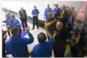
After 4 ends it was time for a wee dram